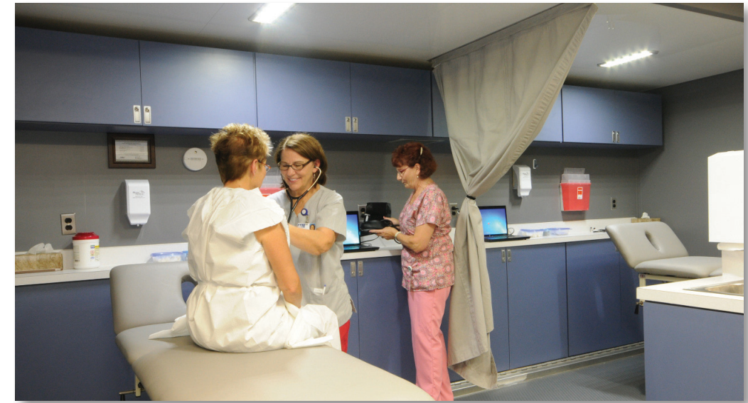
Medical Exam Stations in Semi